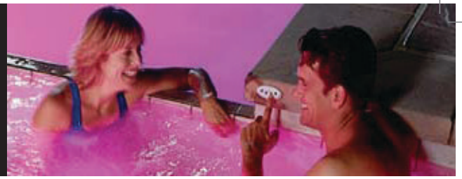
Four-function spa-side remote controls additional items, such as jets, air blower, and heater—without leaving the water.