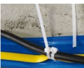
Secure Power Cable to Hose