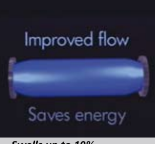
Swells up to 10%