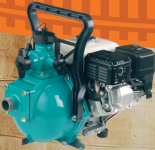
BLAZEMASTER B55H Single stage fire fighting pump. 5.5Hp 4-stroke Honda engine.

DOUBLE YOUR WARRANTY FREE Ask in-store for details