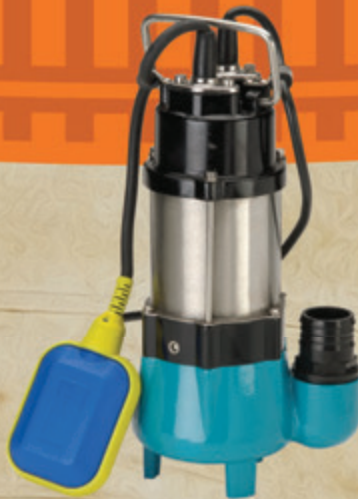
VF150 Domestic drainage, submersible pump.