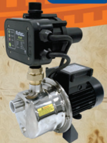
AJP40 Automatic garden pressure pump.